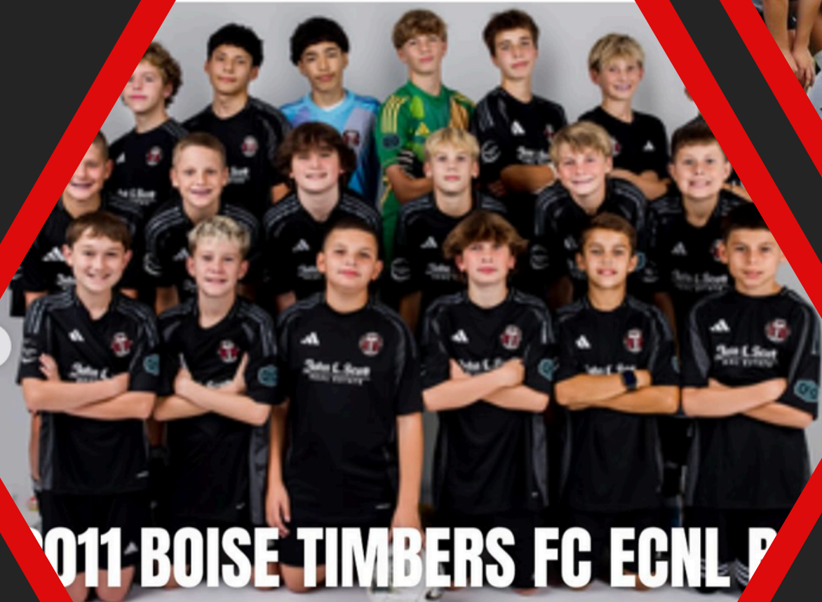
2011 BOISE TIMBERS FC ECNL R1

The Elite Clubs National League (ECNL) is the top youth soccer league in the United States. It provides the highest level of training, competition, and exposure, giving players the best chance to reach college and even professional soccer. With the nation's best clubs and coaches involved, ECNL is the gold standard for player development.